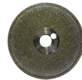
Diamond grinding wheels